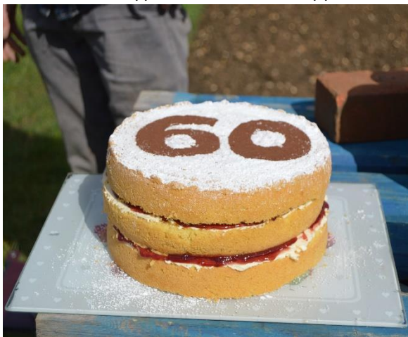
and the cake !